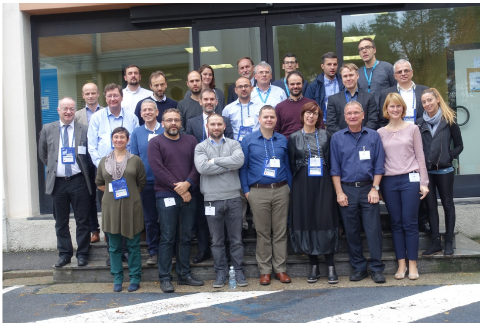
o Participants in the EDO User Meeting 2017 (9/11/2017)

In order to support the further development of EDO and GDO and in order to foster networking of institutions and authorities involved in drought management, it was decided to establish a user and expert network that should meet yearly in order to discuss the status and evolution of drought monitoring, forecasting and risk assessment in Europe and globally. This report results from the first EDO User Meeting held at the JRC Ispra on 9 and 10 November 2017. It details the programme of the meeting, the main points of the presentations and discussions as well as the main conclusions from the meeting.